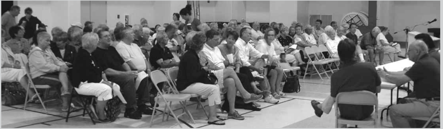
A LOT OF INTEREST - Perhaps the largest group of property owners in a number of years were in attendance at the annual Wawasee Property Owners Association's annual public meeting Saturday. The reason was Oakwood Park.